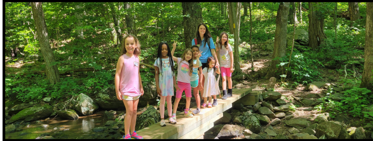
Campers exploring trails

Camp Wintergreen is BACK IN ACTION on the mountain this summer with loads of fun activities and adventures for your campers aged 3-12. We will be offering camp from June 12 - August 18, Monday-Friday.